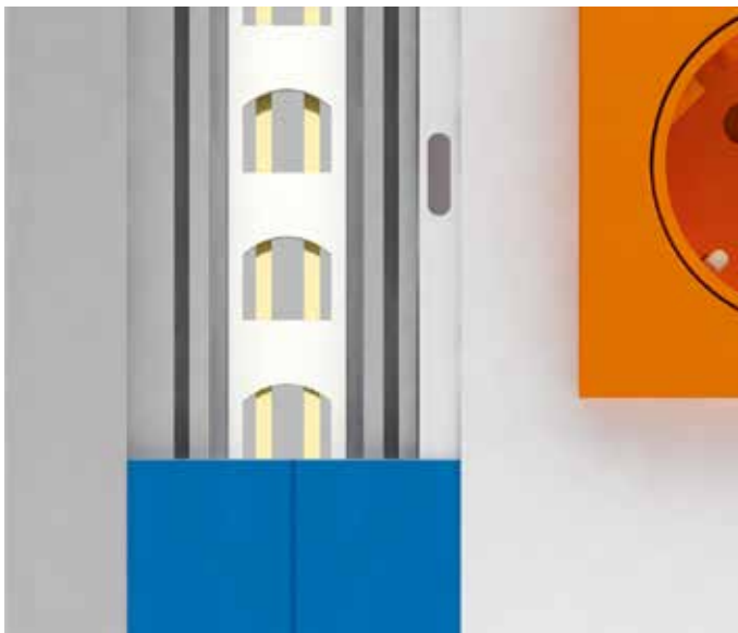
MPC Rail: intelligent with 24 V rail and integrated BUS system