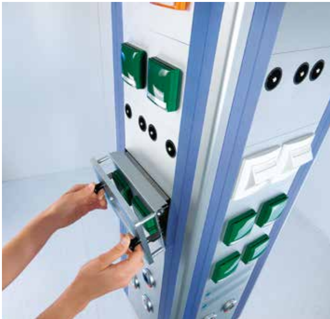
Conversion of a supply module for electricity