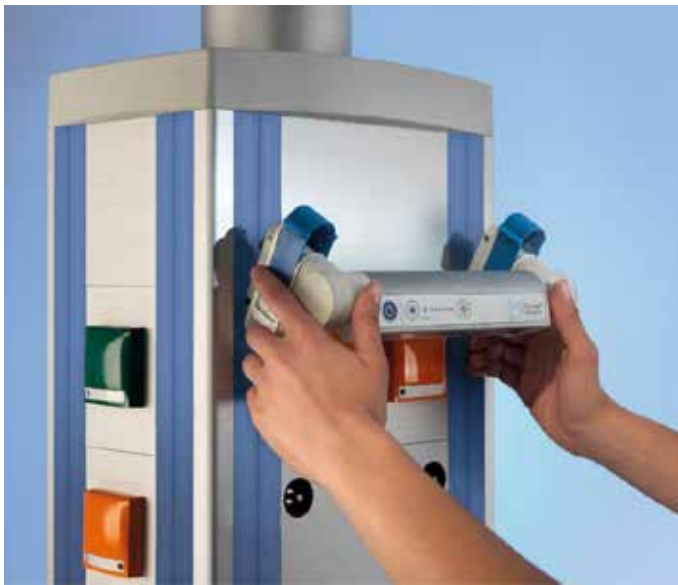
Click mechanism for comfortable, tool-free insertion of pivoting LED lamp

Special electronic workstation components can be attached to the optional MPC Rail which uses low voltage power. Function commands are forwarded via a BUS system, providing for new possibilities for workstations that are more innovative and ergonomic than ever before.