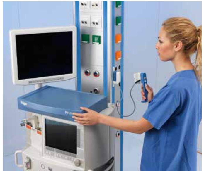
Ease of use thanks to remote control of MPC Rail – for raising the anaesthesia device and operating the brake