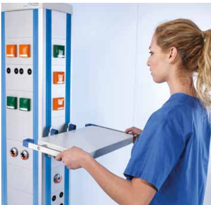
A click mechanism provides for straightforward, tool-free fixing of workstation components such as shelves on every side and at all heights of the support head

Every TruPort™ support head can be equipped with different supply modules required, from gas to electricity and data. Trained personnel can make additions or changes easily without the need for common tools, even after initial installation.