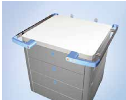
Heavy-load shelf, maximum of four drawers, with optional control handle