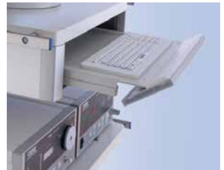
The heavy-load shelf with keyboard drawer makes it easy to document in the room; its handle-free design also makes it easy to clean