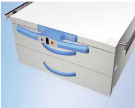
Medium-load shelf, maximum of two drawers, with optional control handle